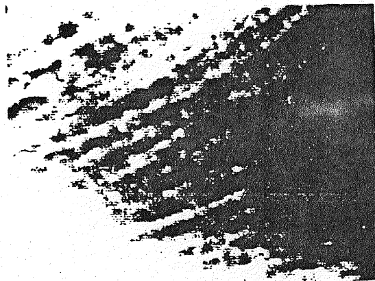
(b) 5 months post-fracture