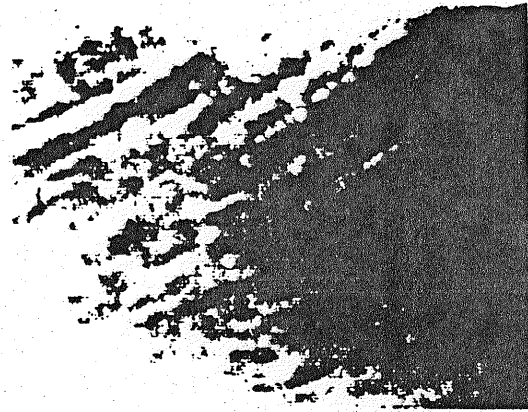
(a) at fracture

Two digital radiographic images of trabecular bone appear in fig. 2, one at the time of fracture (fig. 2a) and the other 5 months post-fracture (fig.2b). The associated relative extrema curves are presented in fig. 3, and indicate that disuse osteoporosis leads to a reduction in the number of relative extrema (Table II). This particular feature should be especially relevant to the diagnosis of bone loss diseases since it is a statistical representation of the trabecular bone spacing and density. These radiographic analyses may also have significance with respect to their ability to predict the overall biomechanical competence of trabecular bone 9 .