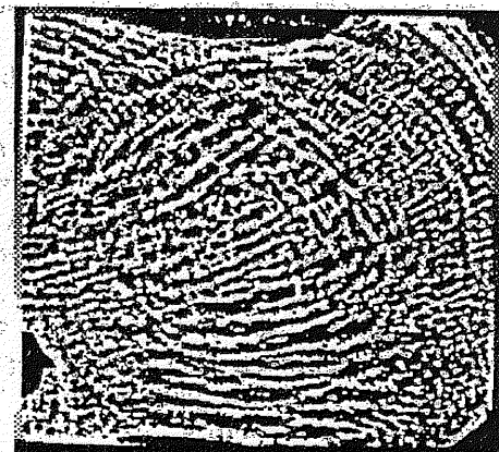
Fig. 3. Thresholded image associated with Fig. 2.